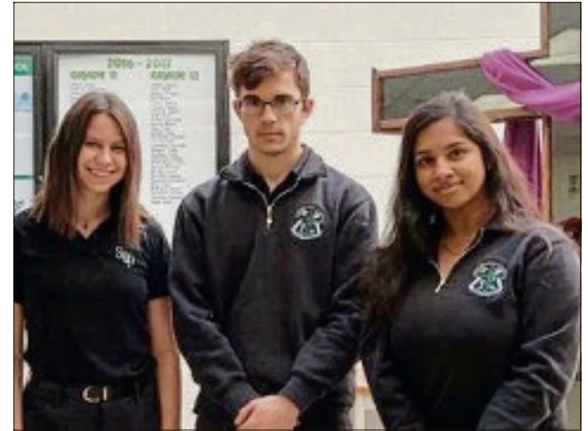
St. Paul Catholic Secondary School photo

For their creativity, effort, and engagement with